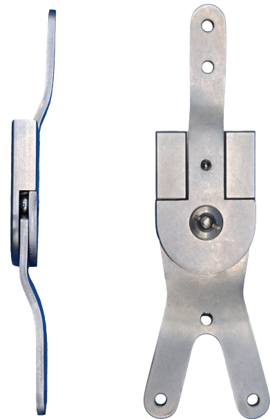
Screw & Bushing Midsection Design