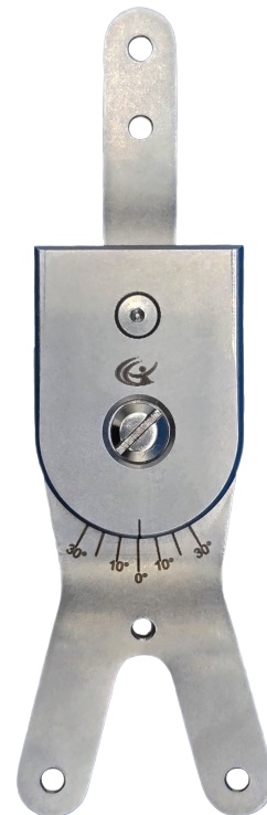
Adult Vertex Double Action