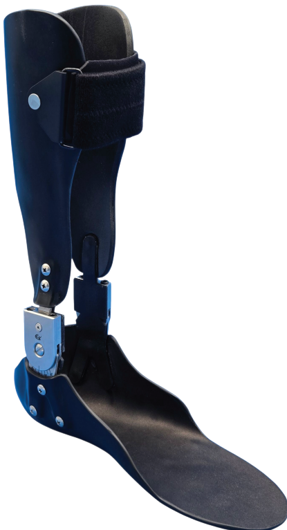
Pre- Contoured Uprights